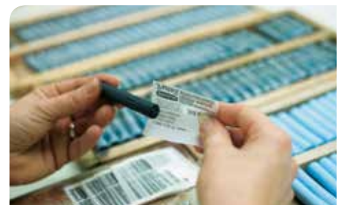
Handetikettierung der Schmincke Pastelle Handlabelling of Schmincke pastels