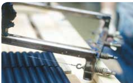
Drahtbespannter Rahmen zum Schneiden der Pastelle Wire-strung frame for cutting the pastels